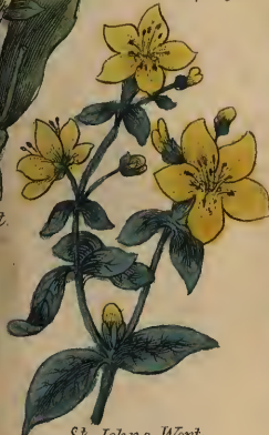
S. John's Wort.